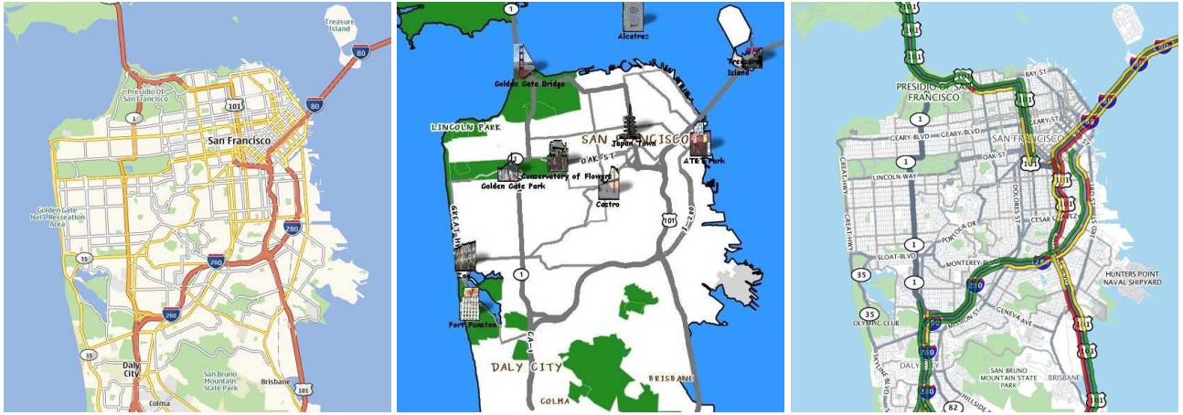
Figure 1: Retargeting maps for better readability. Left: Map of San Francisco rendered without any retargeting and stylization. Center: Map of San Francisco with retargeting and tourist map stylization applied. Right: Map of San Francisco with traffic stylization applied.

for pedestrian navigation on a mobile phone, indicates the correct walking direction to the pedestrian [15]. Rohs and Essl investigate different information navigation methods for handheld displays using a range of sensor technologies for spatial tracking [14]. Touch & Interact extends the phone output to a public display allowing both screens to share the display space for a tourist application [9].